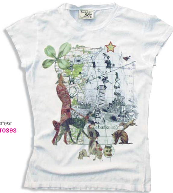
barkorama cap sleeve crew #T-BKRWHT0393 WHITE