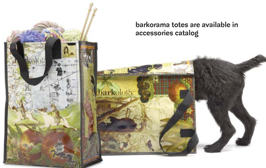
barkorama totes are available in accessories catalog

fabric 100% combed ringspun jersey; garment washed